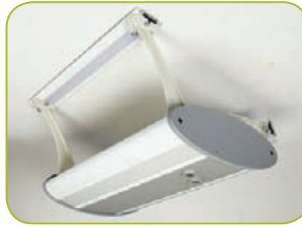
SWAN configured with Constellation Set