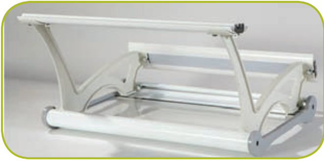
SWAN base model